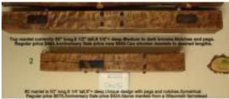
Timberwoods Mantel Photo ORIG46 (50' - 60" lengths)