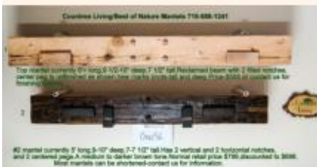
Timberwoods Mantel Photo ORIG56 (5' - 6' lengths)