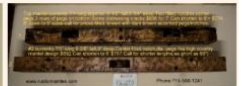
Timberwoods Mantel Photo ORIG67-2 (7' and can shorten)