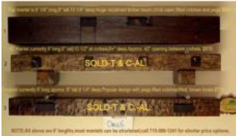
Timberwoods Hand Hewn Mantels (5' - 6' lengths)