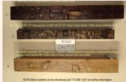
Reclaimed Wood Mantels (4' - 5' lengths)