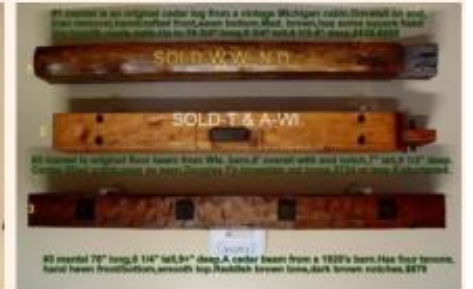
Timberwoods Mantel Photo ORIGMIX2 (5' - 6' lengths)