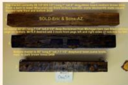
Timberwoods Mantel Photo ORIG54 (4' - 5' lengths)