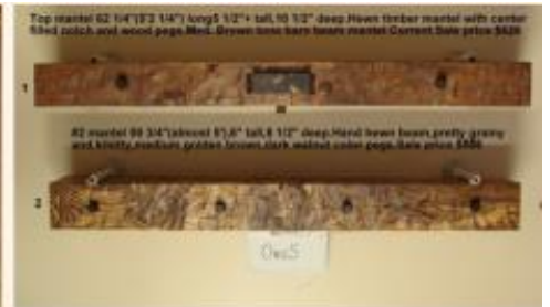
Timberwoods Mantel Photo ORIG5 (5' - 6' lengths)