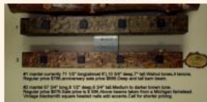
Timberwoods Mantel Photo ORIGL2 (6' - 7' lengths)

If you see a mantel you like in the photos above, contact us at (715) 588-1241 with the photograph #/Info of which mantel for an exact price based on your specified length.