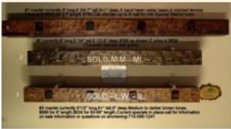
Timberwoods Mantel Photo ORIG68 (6' - 8' lengths)