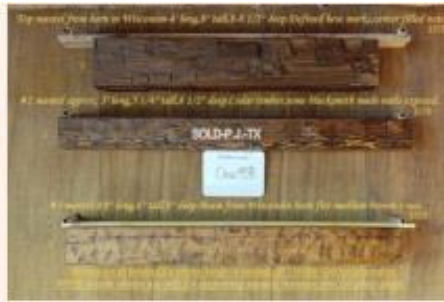
Timberwoods Mantel Photo ORIG45B (4' - 5' lengths)